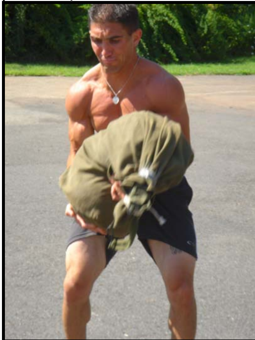
Above, wrestling with a sandbag during a long walk of heavy sandbag carries. This man's rugged physique came through all the basics, nothing fancy, lot of hard work, consistency and determination!